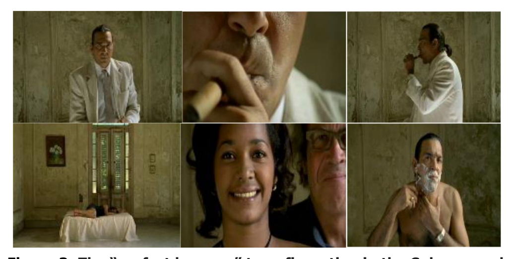
Figure 3: The "perfect humans" transfiguration in the Cuban remake

The hardest challenge faced by Leth was during the shooting of the first remake in Cuba, where no shot should have been longer than twelve frames. Leth declared that he had plenty of time before the shooting, half-year to prepare it but only one week to shoot it. There were 1200 cuts at the end of the working days (Kaufman, 2004). The combination of the exotic location and the injunction for the voice-over to provide answers to the questions posed in The Perfect Human results in a frantic but well-paced exposition of some themes of the original film transposed in the Cuban atmosphere. In the first preparing scenes, we attest to the selection of the actors: a local dancer, a "true Cuban man", and another woman. The location is an antique building, which shows the signs of time and provides a textural grain coherent with the rest of the images ( Figure 3 ).