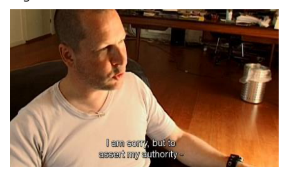
Figure 1: This is how a tyrannical commissioner looks like

From another point of view, it has been clarified elsewhere that the compliant reception of the subordinate Leth minimises the charge of exploitation. It depicts Trier's image in a more sarcastic guise and, consequently, smooths his initial arrogance (Dwyer, 2008). This mitigating aspect has also been noted by Perkins (2010), who highlighted how Trier posed himself as a deliberate auteur in the attempt to break Leth's minimalist or mannerist style of The Perfect Human by allowing the emergence of his inner truth.