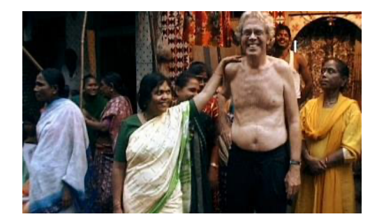
Figures 8 & 9: A woman begging for money and another one sympathising with Leth

Transactional punishments and the ideology of self-management