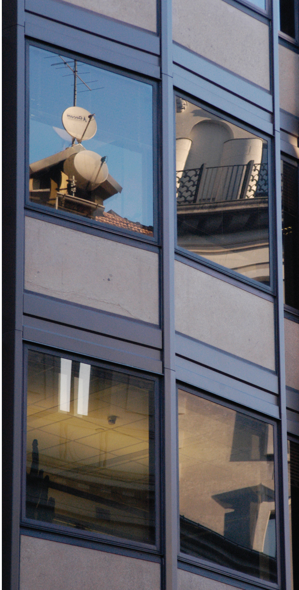
20 Jan 2001 Location: Milan. 1/250 sec at f/5.6. Focal length 112mm. Nikon D100.