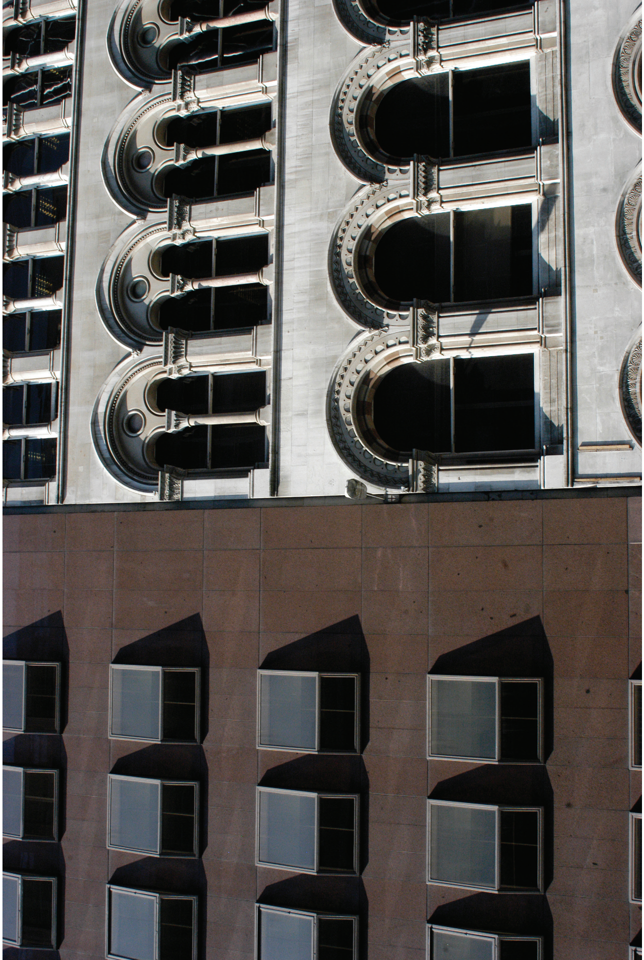
28 May 2001. LOCATION: The City, London. 1/400 sec at f/9.5 Focal length 32mm. Nikon D100.