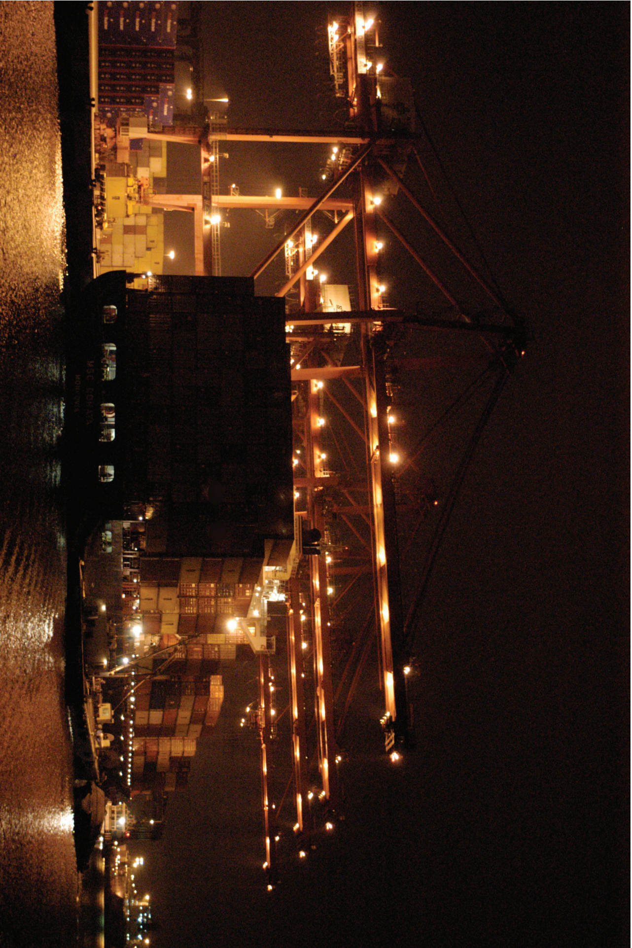
7 June 2001 LOCATION: Port of Long Beach, California 1/50 sec at f/4.0. Focal length 40mm. Nikon D100.