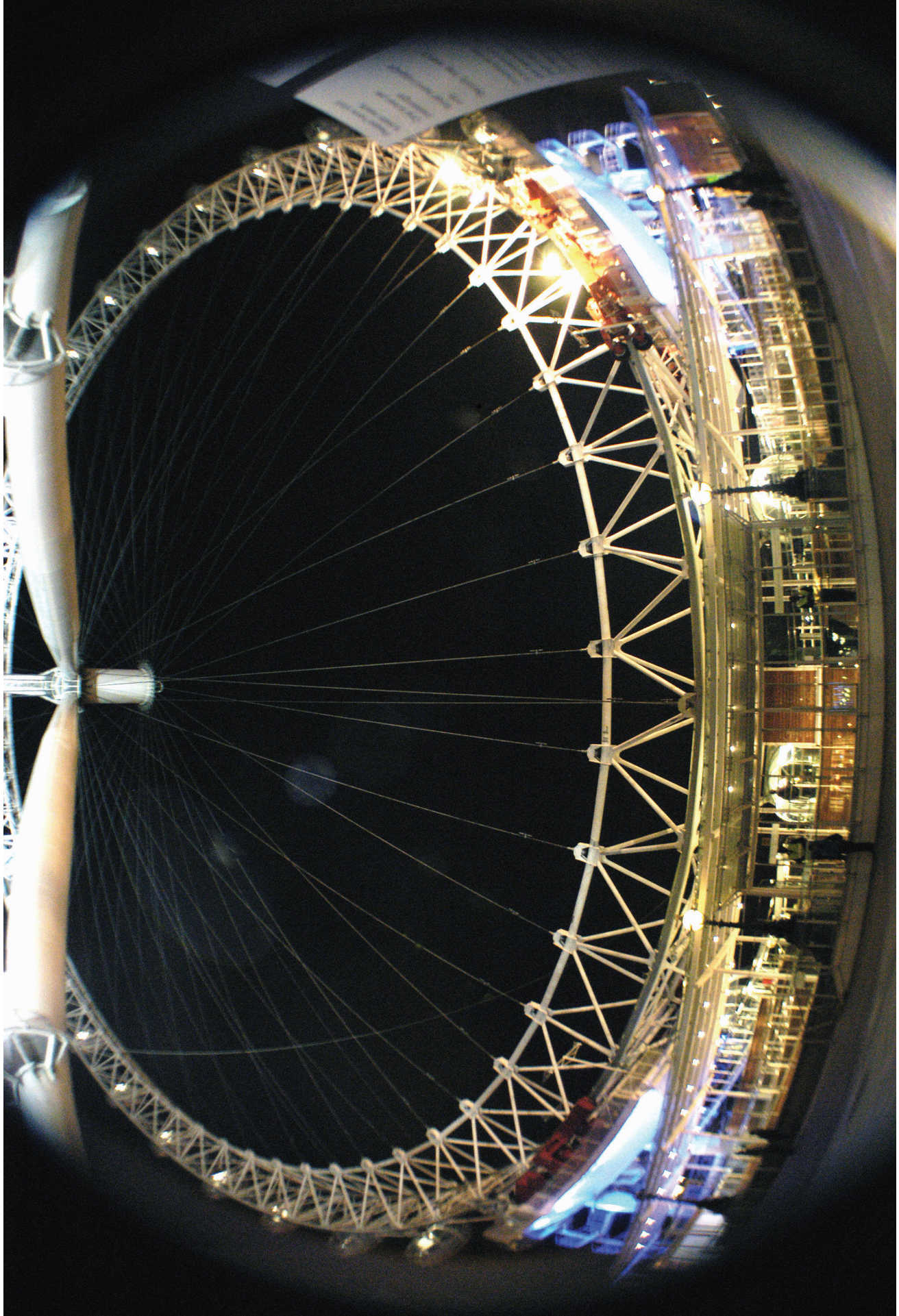
9 Sept. 2002 LOCATION: London Eye. 1/10 sec at f/3.3. Focal length 24mm with fisheye adapter. Nikon D100.