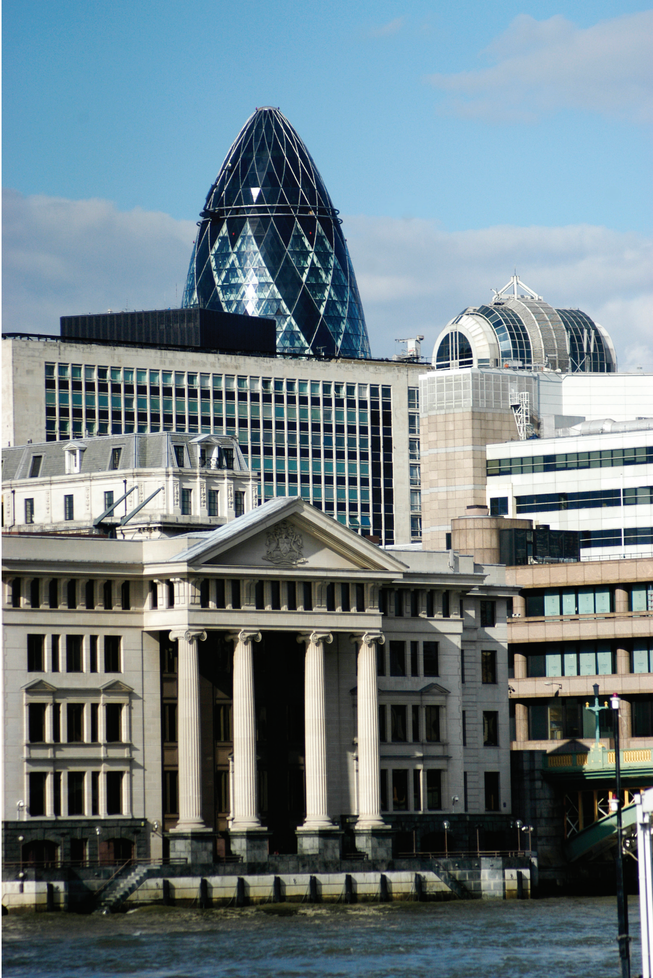
23 May 2001. LOCATION: The City, London (from Shakespeare's Globe). 1/400 sec at f/4.5. Focal length 130mm. Nikon D100.