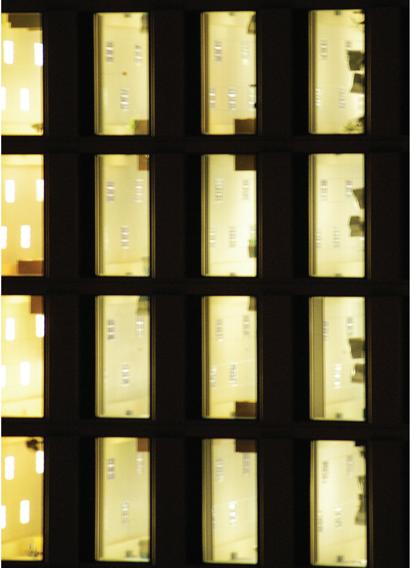
9 May 2002. LOCATION: St. Gallen, CH. 1/8 sec at f/4.5. Focal length 155mm. Nikon D100.