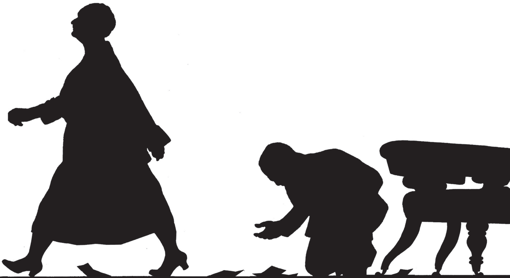
Watch: Silhouettes by Barbara Loftus (digital prints, 7" x 113/4")