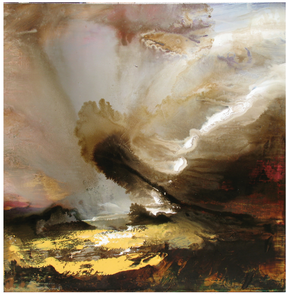
Storm Arising (oil on canvas) 700x600mm