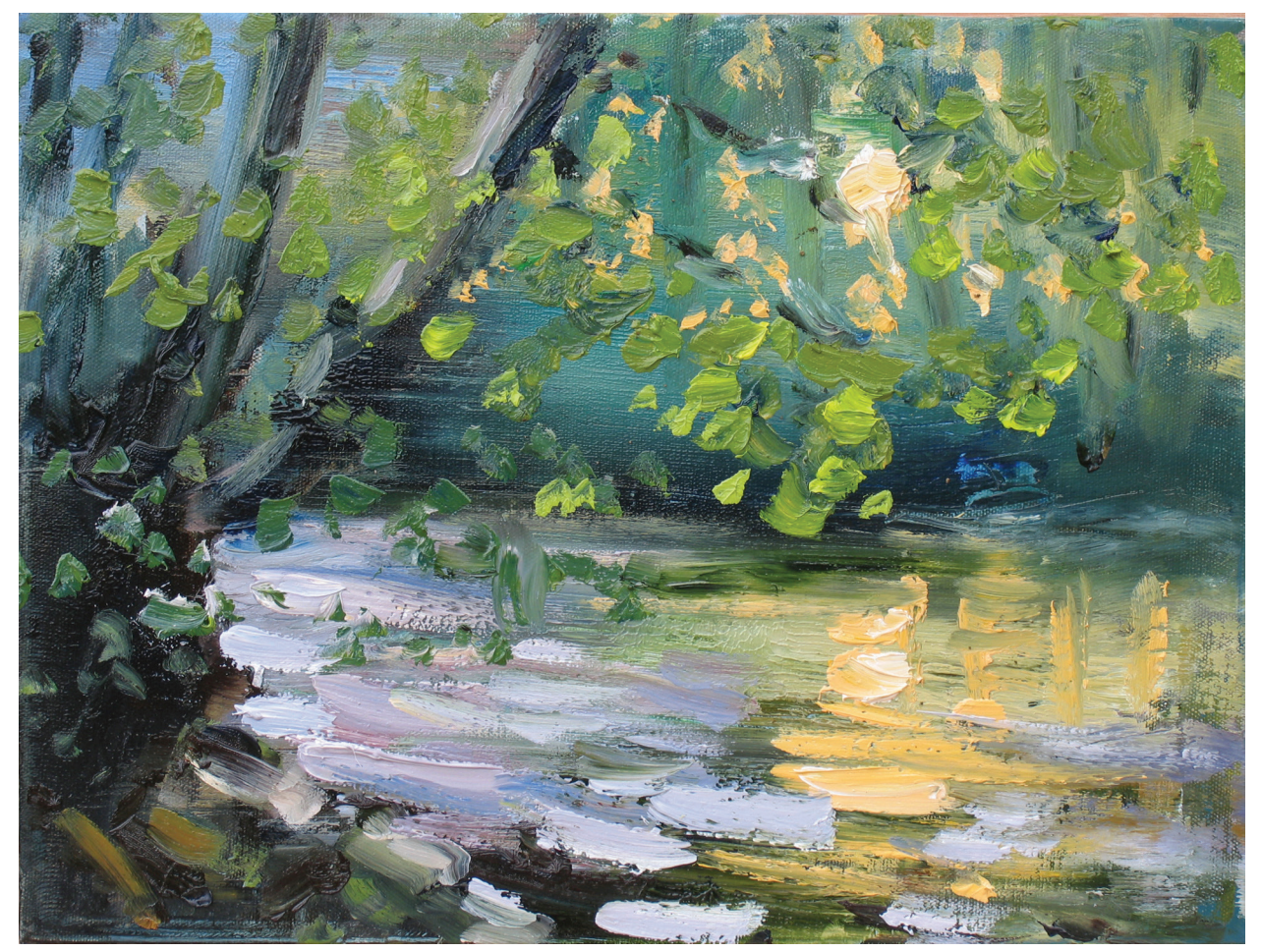
Derwent Sunset (oil on canvas) 600x750mm