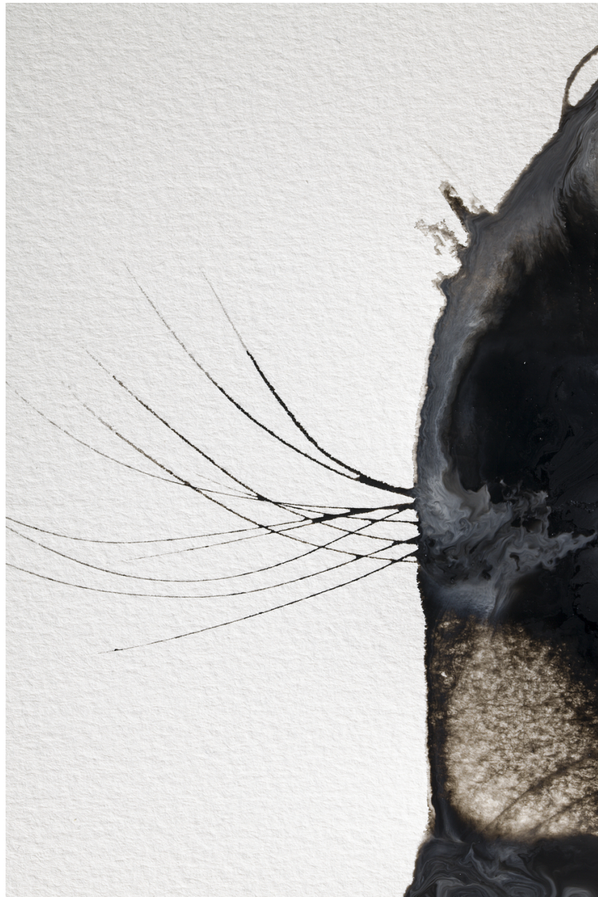
Figure 6 - Impossible Creature - manifest 6

At such moments, aesthetics is exposed as an emergent property - the chaotically coherent organization of form, surprisingly composed in a fashion that stirs our being into presence. It emerged not by an external vision imposed upon inert matter, nor solely by the efficiency of material randomness, but by stemming powerfully from the deep structure of the process that renders the complex sensible.