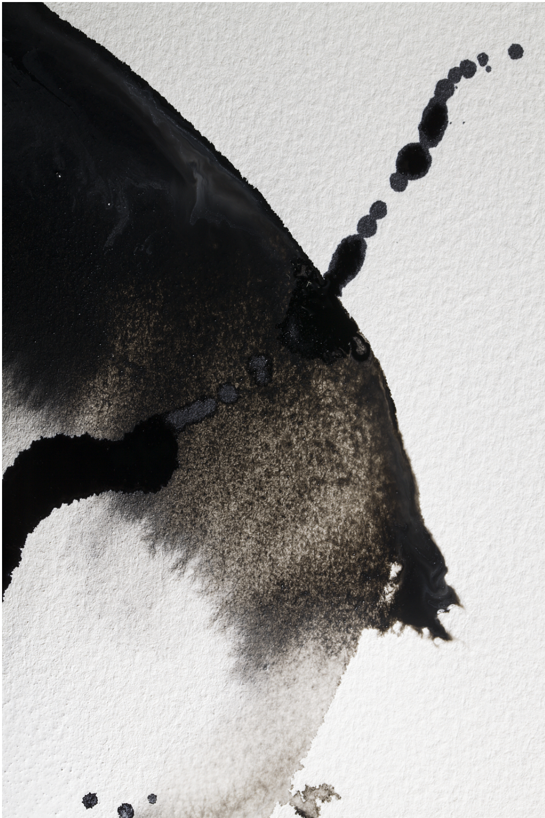
Figure 8 - Impossible Creature - manifest 8

In front of my eyes, painting opens a vertical gaze into the genesis of form. For brief instants, causality is exposed in whirls of interconnected subtleties, history not yet on its path to be interpreted, as a fine line that grows tangible, where the inevitable meets vision and where generation is fertile.