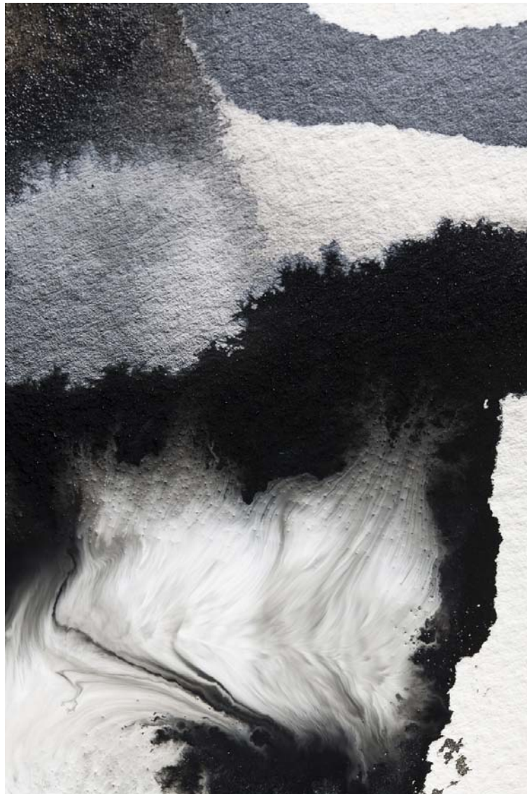
Figure 4 - Impossible Creature - manifest 4