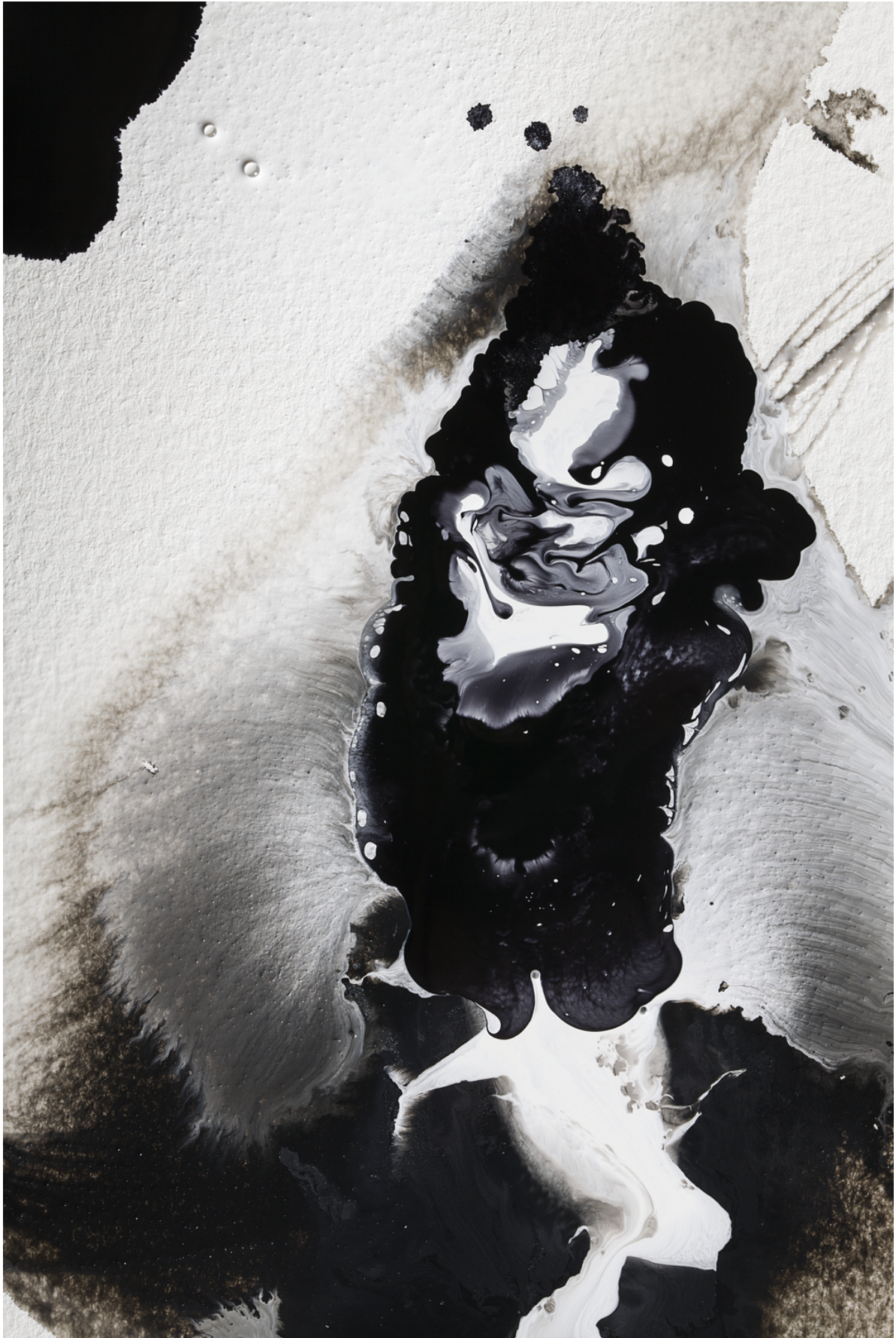
Figure 7 - Impossible Creature - manifest 7