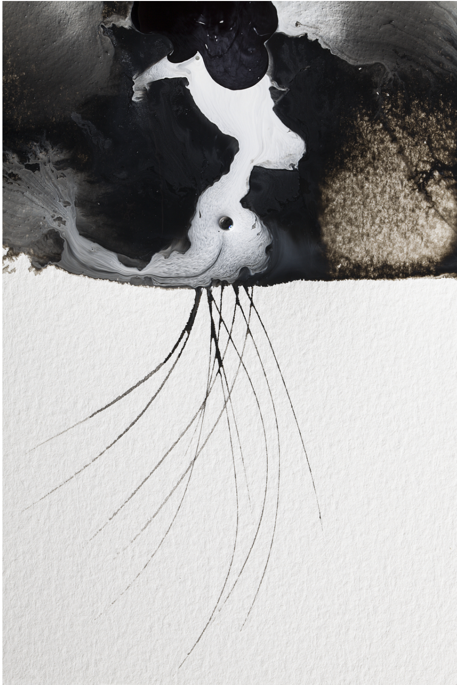
Figure 2 - Impossible Creature - manifest 2

since, and today more than ever, Art declares that aesthetic is not arrested in frozen objects, but rooted in the open dynamics of life, in the complex activity through which forms emerge, sustaining and modifying themselves. The journey of an artist into morphogenesis and aesthetics happens between experimental exploration and selected constraints. Through the subtle interplay between the chaotic and the coherent the artist understands aesthetic from within. The outcome is a work that confronts the constraints of what is the expected dénouement of a painting, and explodes in a multiplicity of images and worlds.