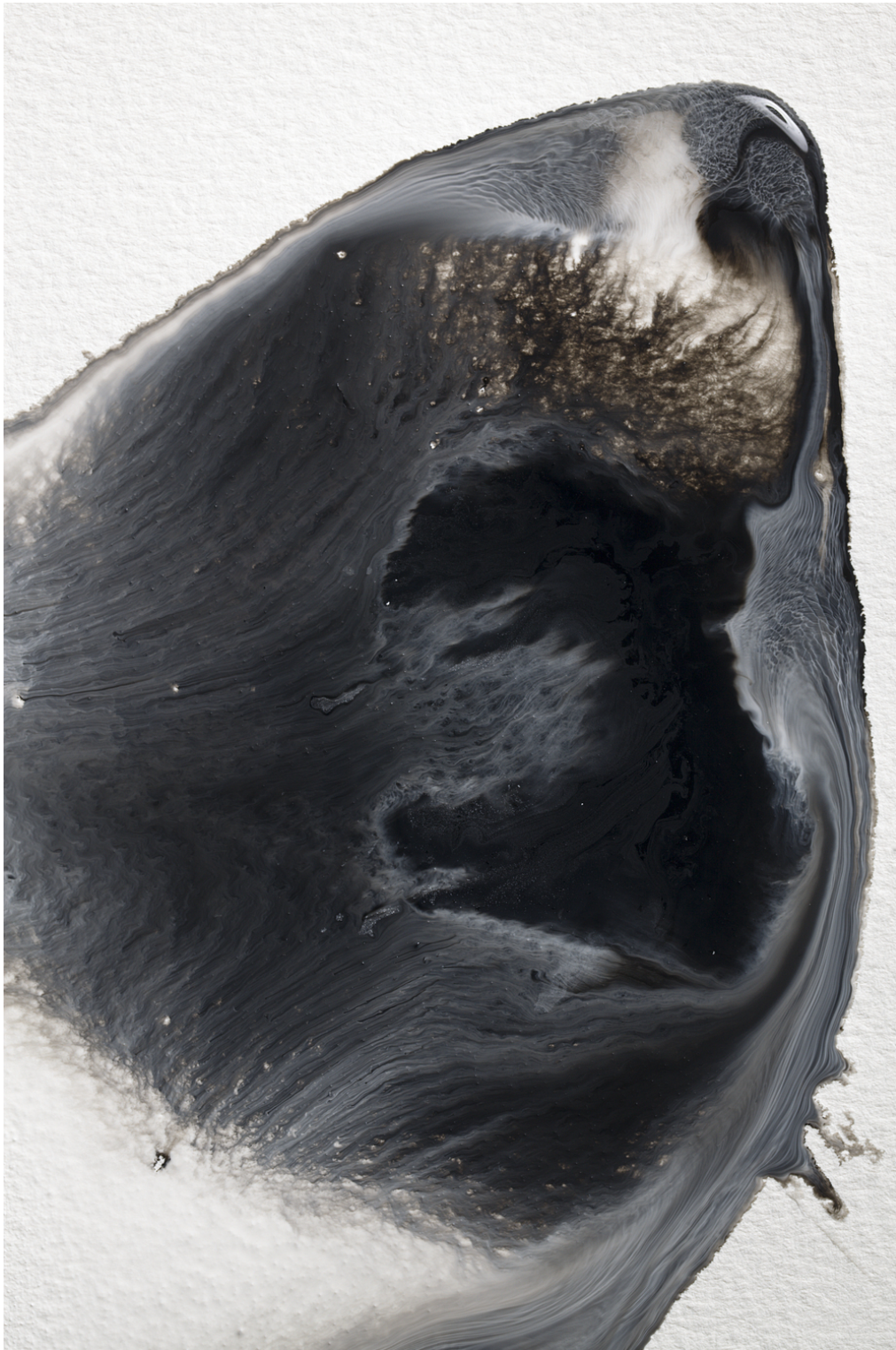
Figure 1 - Impossible Creature - manifest 1

Art puts a question upon the world of ideas and perceptions. A question that artists pause upon in their every day practices with matter, mediums and minds. It is composed of the vivid sense of openness, unpredictability and chance that emerges with creativity: how open is the world around us – and in us? It comes to challenge the vision we have concerning the world and primarily the notion of strong determinism. Art is occupied in the generation of forms, from the times of its beginning in the caves of the Paleolithic. Ever