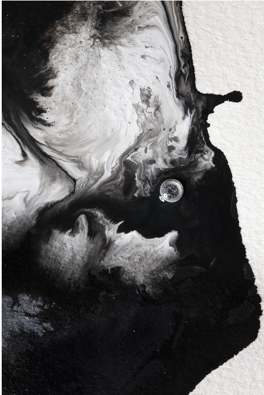
Figure 5 - Impossible Creature - manifest 5

Can any sharp cut be made then, while form emerges somehow, between active and passive, organic and inorganic, subject and substrata, vision and necessity? Opposite and complementary emotions bring about those ephemeral and fertile edges, where one is engrossed to search for the sudden emergence of mind-evoking shapes along the iteration of shifting borderlines.