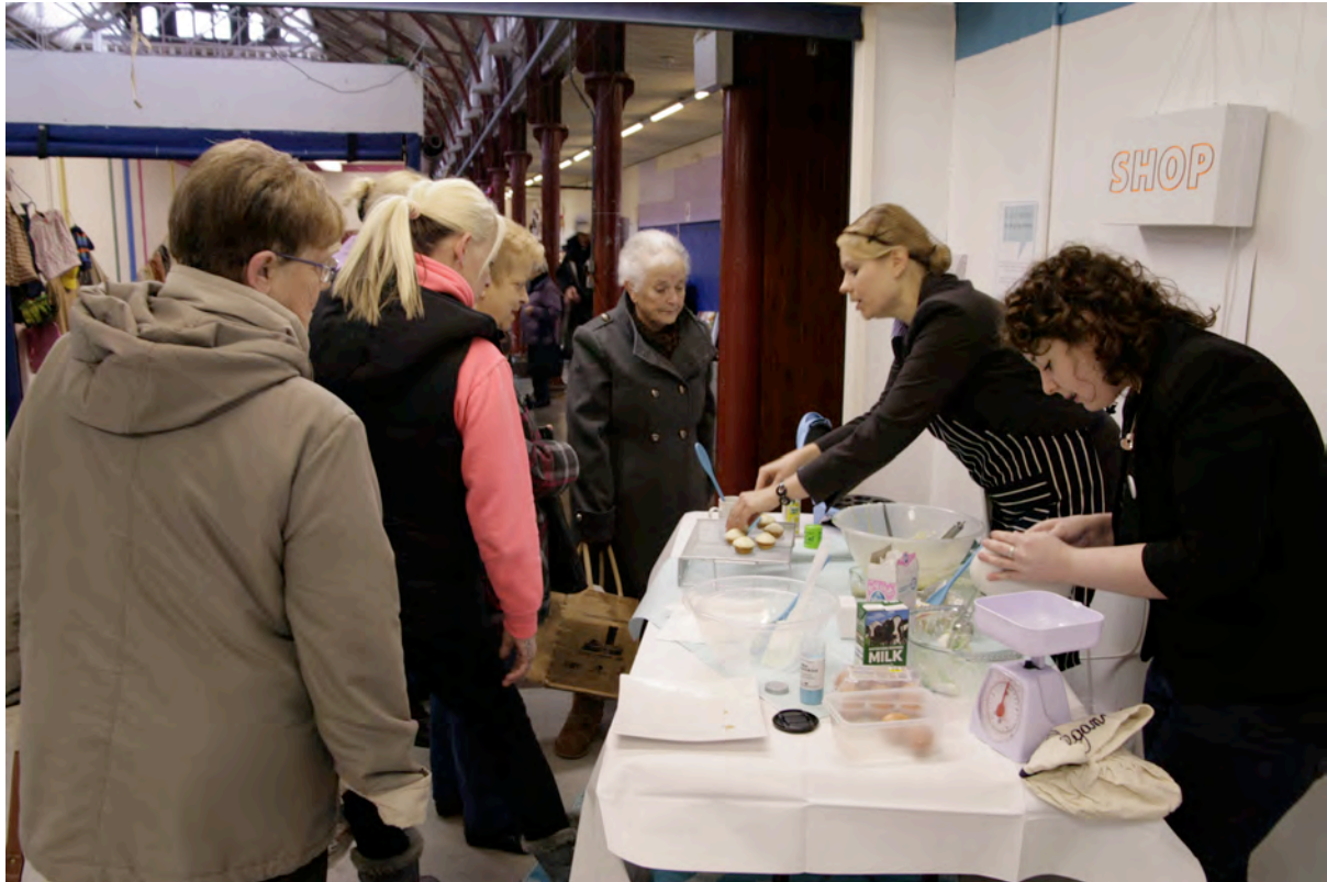
Figure 1. Mellor Management in Pontypool, Pop-Up Bakery