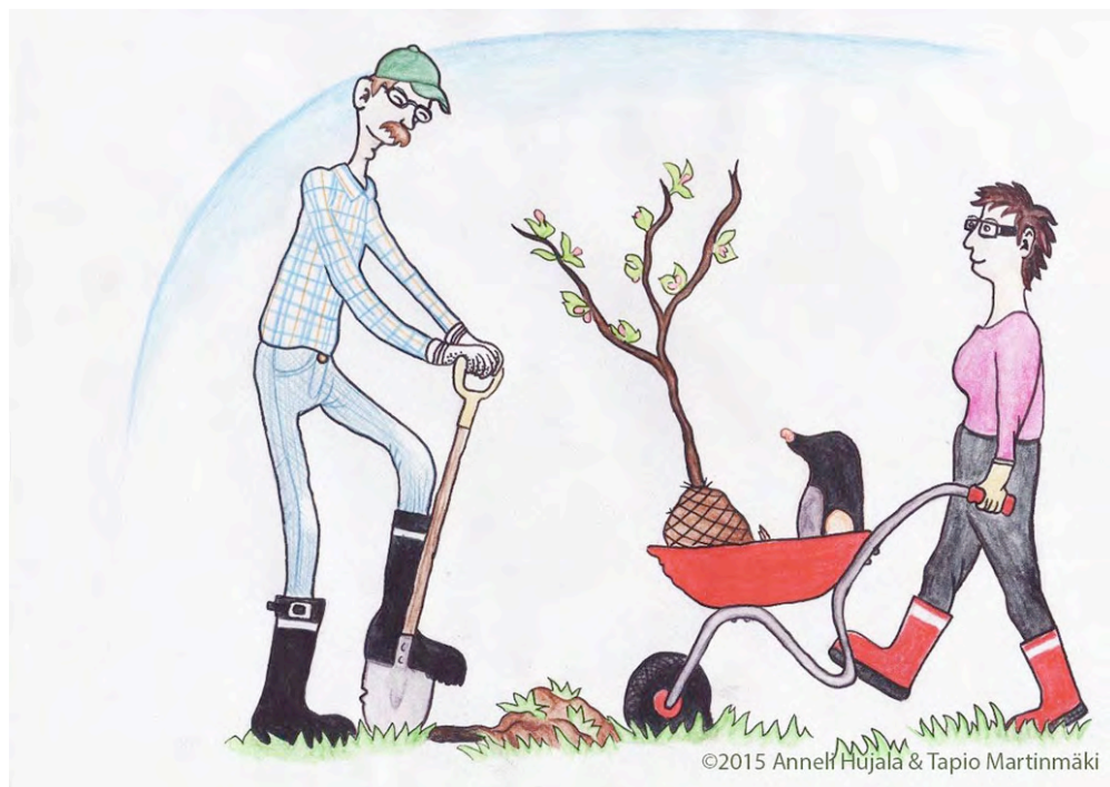
Figure 3. Pragmatism

Spring has come. The soil smells sweet in the sunshine, nature is just about to begin to bloom. A married couple, with itching fingers, is full of enthusiasm for gardening. They get to grip with the apple tree through concrete practical work, as in his own way does the mole.