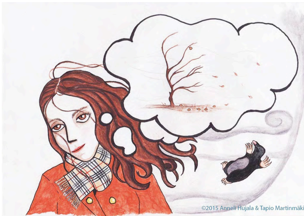
Figure 4. Phenomenology (of the body)

In phenomenology (Husserl 1995/1950; Schütz 2007/1932; see also Heinämaa 2010) the starting point is the individual: the individual's consciousness and experiences. Phenomenology pays attention to the relation between the individual and her/his environment, including the physical environment and other people with their physical bodies, but clearly from the perspective of the individual her/himself. In the phenomenology of the body (Merleau-Ponty 1993, 2000/1962) in particular, the main interest and focus is the body and embodied experiences. The body is the zero point of an individual; s/he lives from and through the body. Thus leader-follower relationship, for example, is not only a social or discursive construct, but also an embodied phenomenon. We do not only see, hear and think other people, we also feel them through our bodies and all five senses. We also experience and create the leader-follower relationship through our bodies, not only through thinking and speaking. "The world is not what I think, but what I live through" (Merleau-Ponty 2000/1962, xvi-xvii).