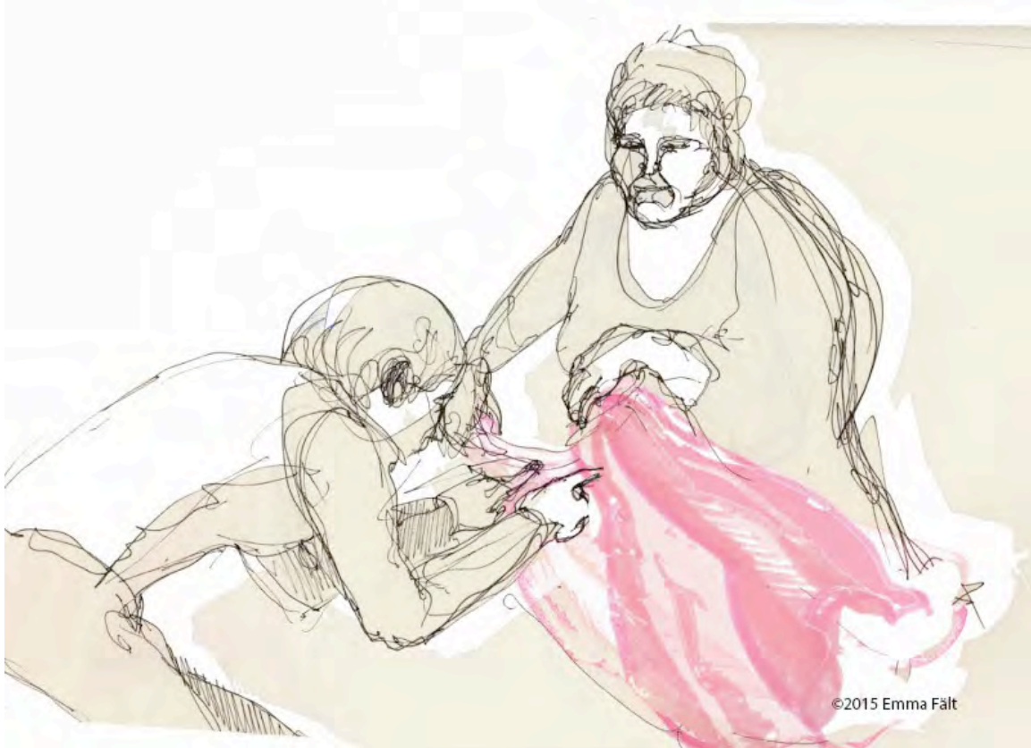
Figure 7. Challenging and fighting I (Paso doble dancer)

In the paso doble there are clear roles, it is about hierarchy and dominance. However, the roles in this dance were not conventional and not fixed. The performer was the matador, but occasionally she even gave the red rag to one of her "bosses". She felt that the relationships thus consisted of reciprocal challenging, and the power positions shifted from one to the other during the dance interaction. As Figure 8 shows, the dance was not a constant fight. There were also parts where the two dancers danced together with a common tune and occasionally the dancer briefly let the "leader" take the lead. For the Paso doble dancer leadership is interaction between two equal individuals, both of whom influence each other and the behavior in each situation is a response to the other person's behavior.