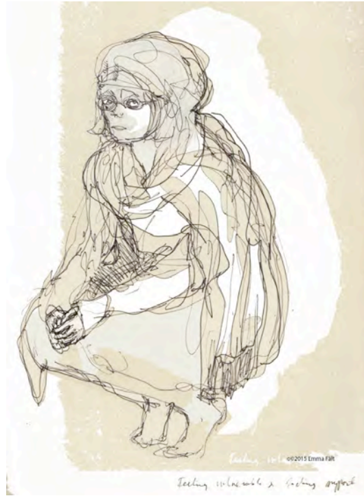
Figure 9. Feeling invulnerable and lacking support (Piaf dancer)

The New York dancer who was seeking for her place, reflected like this: