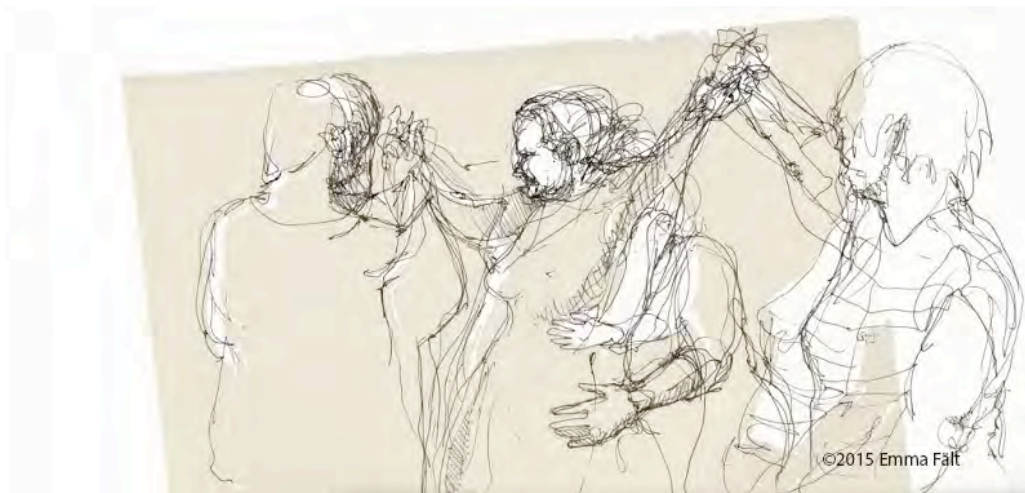
Figure 5. Collaborative enthusiasm (Pompeii dancer) 3

The Piaf dancer's entrance to her performance (starting by standing alone in the middle of the room) constructed the participant's own solo of the independent woman and a personal survivor. The managers were ignored even though there were some indications in the choreography that the performer expected bosses' support and more active participation by them.