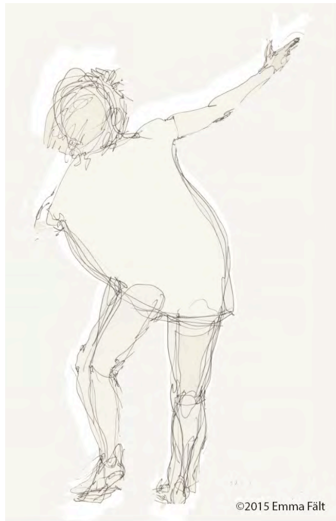
Figure 6. Hesitant search for a common tune (Tango dancer)

The Tango dancer explained that the stumbling and wobbling in her performance described her frustration at the poor leadership (Figure 6). This frustration was caused in particular by the controlled and slow decision-making in the organization. Afterwards, however, the dance performance compelled her to contemplate her own attitude towards these problems. The most important consequence of this pondering was that the Tango dancer ended up considering what she herself could do to solve these problems.