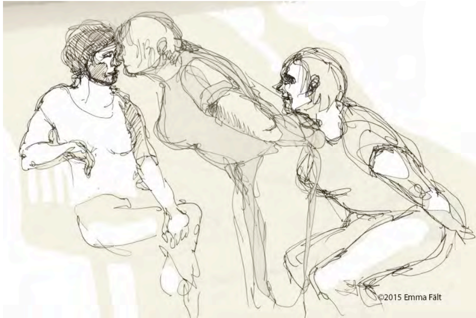
Figure 10. "It was thrilling to notice that I am such a powerful actor!" (New York dancer)