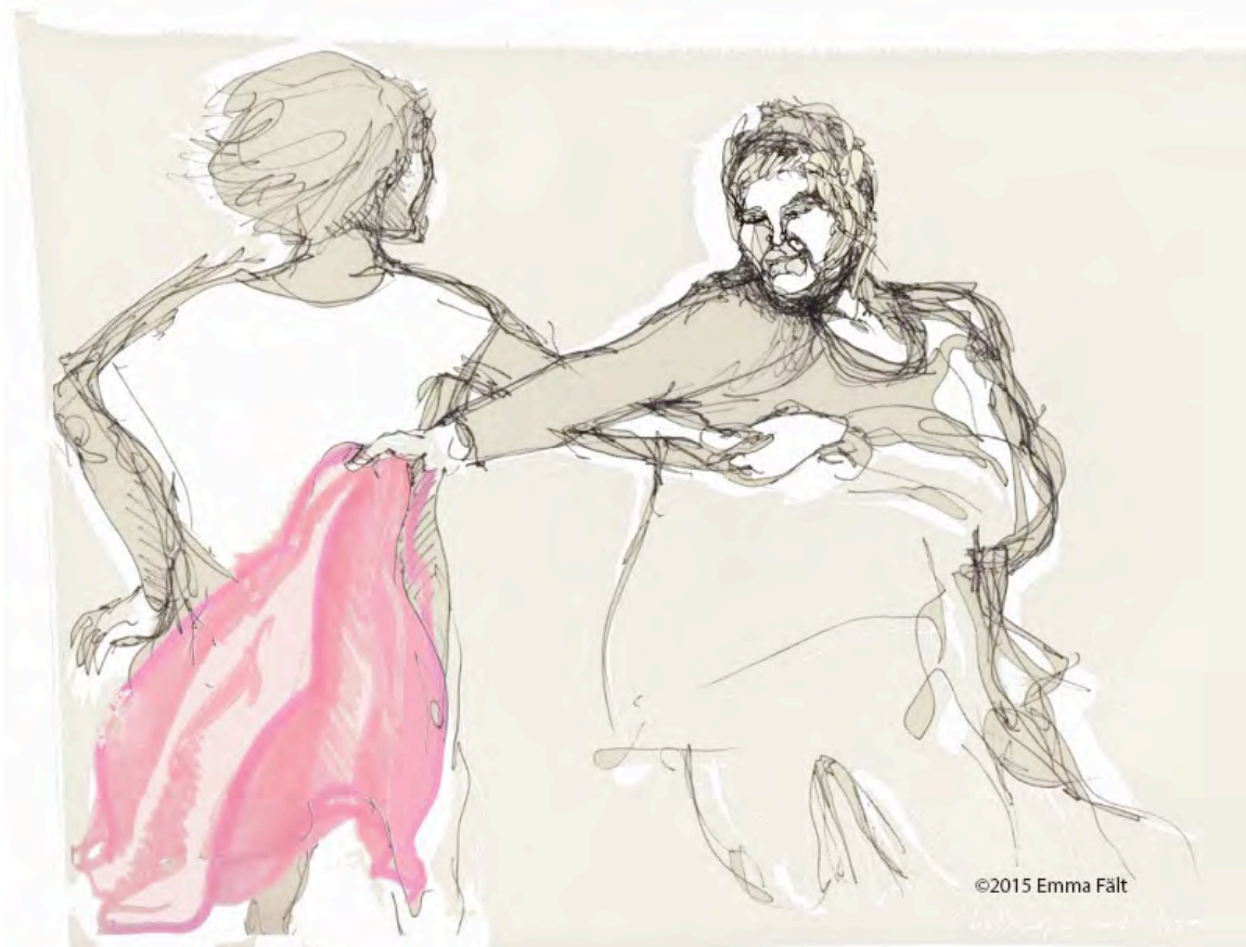
Figure 8. Challenging and fighting II (Paso doble dancer)

The powerful music and movement evoked strong emotions. The Paso doble dancer emphasized that even though the performance was only a dance, not an actual bullfight, the feelings it aroused were almost tangible.