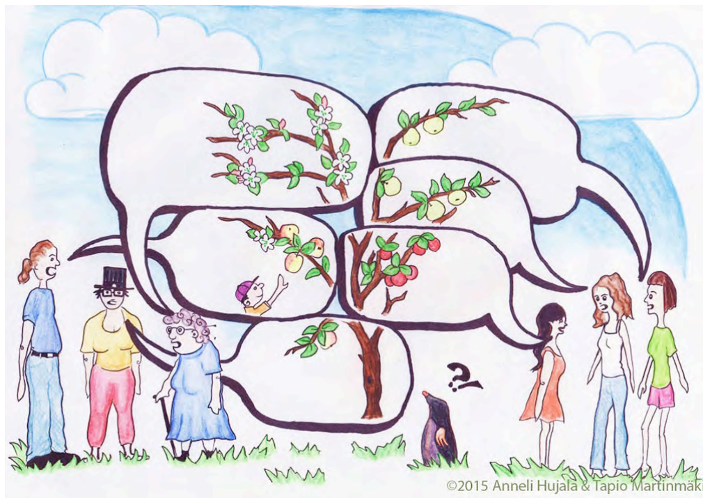
Figure 1. Social constructionism

In the first picture (Figure 1.) the sun is shining and family members are enjoying a beautiful summer day. When they look at the very same apple tree, they see and think very different things. The grandmother remembers the apple blossoms on the trees in Karelia, which was lost to Russia during World War II. The scientist in the family recalls the Latin names of the flora. The girls speak about the jam the apples produce and the youngster tells a story about exciting apple stealing expeditions.