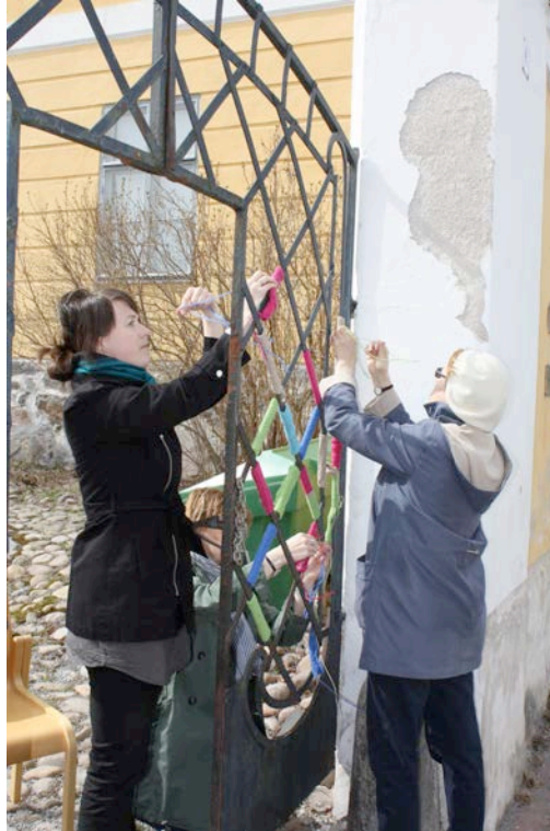
Picture 2. Attaching the final knitted pieces to the museum gate.

The staff often spoke of what the public's response to the pieces would be. The knitting certainly attracted attention and was welcomed, so meeting its visibility objective. Many visitors and passersby came in with questions about the pieces, admired the handicraft, and wanted to participate in a process that was actually already in practice finished. This request prompted the museum staff to put a yarn basket in the museum café where it was available to customers wishing to contribute knitting for the whole summer, even though the exhibition had been launched months before.