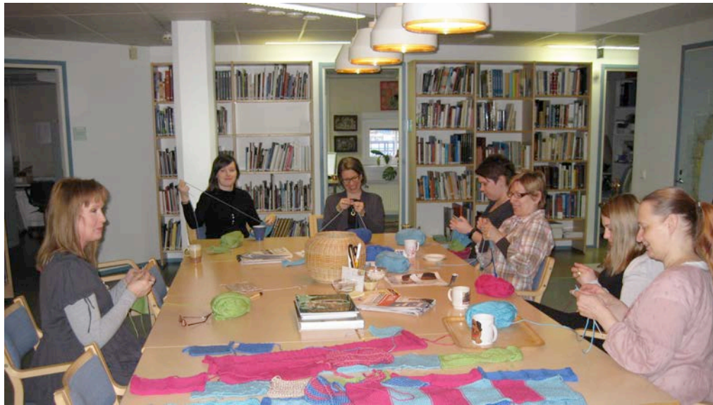
Picture 1. Knitting in action

It felt good to do something with your hands during an office work day. The knitting offered a break that inspired creativity in us. The knitting as such felt nice but it also fed feelings of togetherness and belonging as the knitters belonged together and became a tight group organized around the project. The knitting encouraged a positive and relaxed atmosphere and became the glue holding the staff together. (Museum manager)